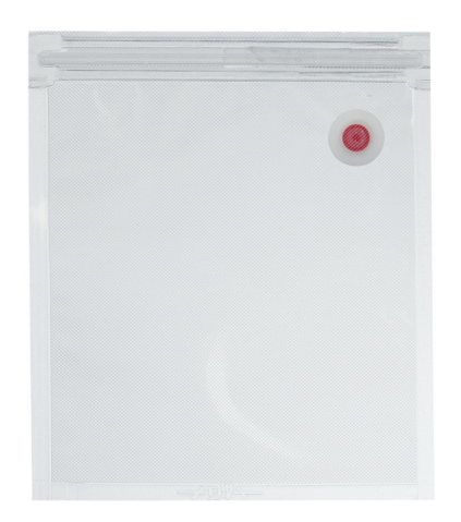
WVSQT Quart Vacuum Bags